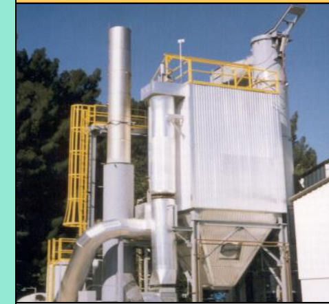
Amerair & CAMCORP